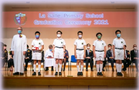
Students receiving their certificates