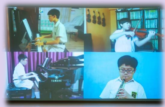
Because of the pandemic, we had a virtual performance this year.