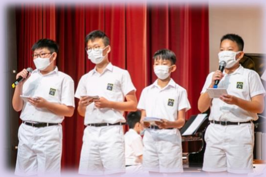
Vote of thanks by our students