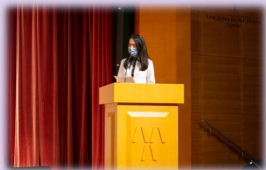
Class teacher reading out the names of their students