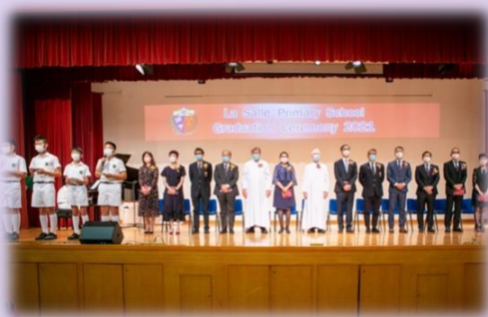
Group photo of the IMC

Below are some pictures from the ceremony we would like to share with you: